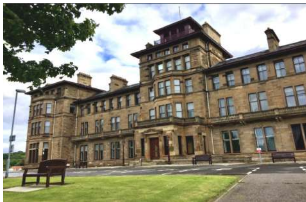
Craiglockhart Castle War Hospital - Edinburgh