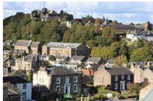
Photos taken from the top of the Church Tower